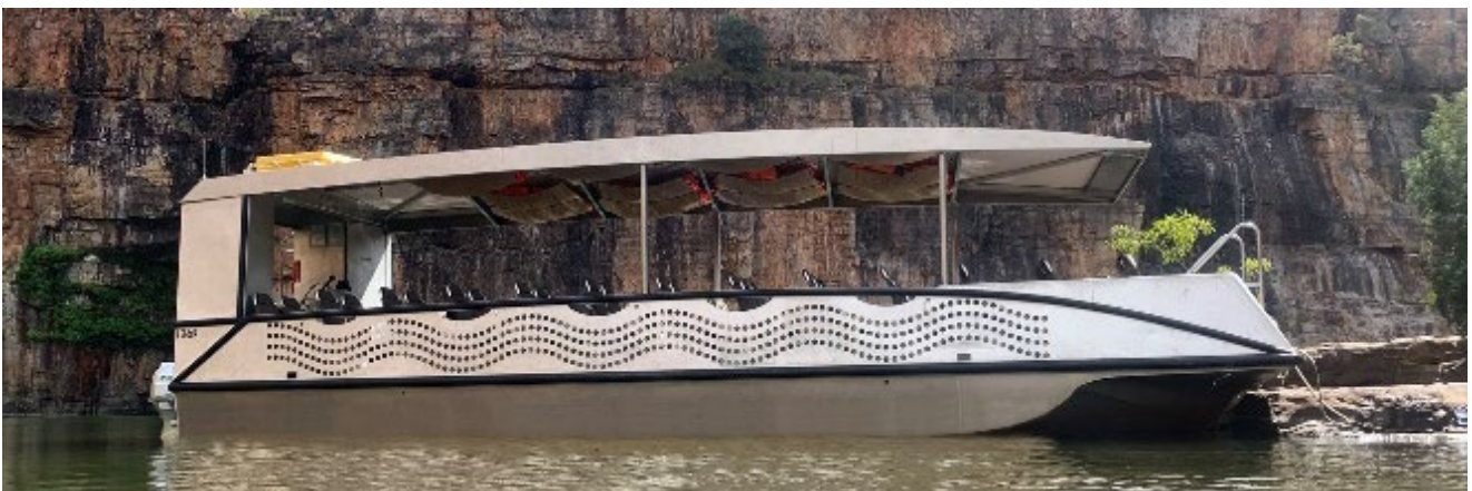
NT01 - 12m tour vessel, built in Darwin for Katherine Gorge NT