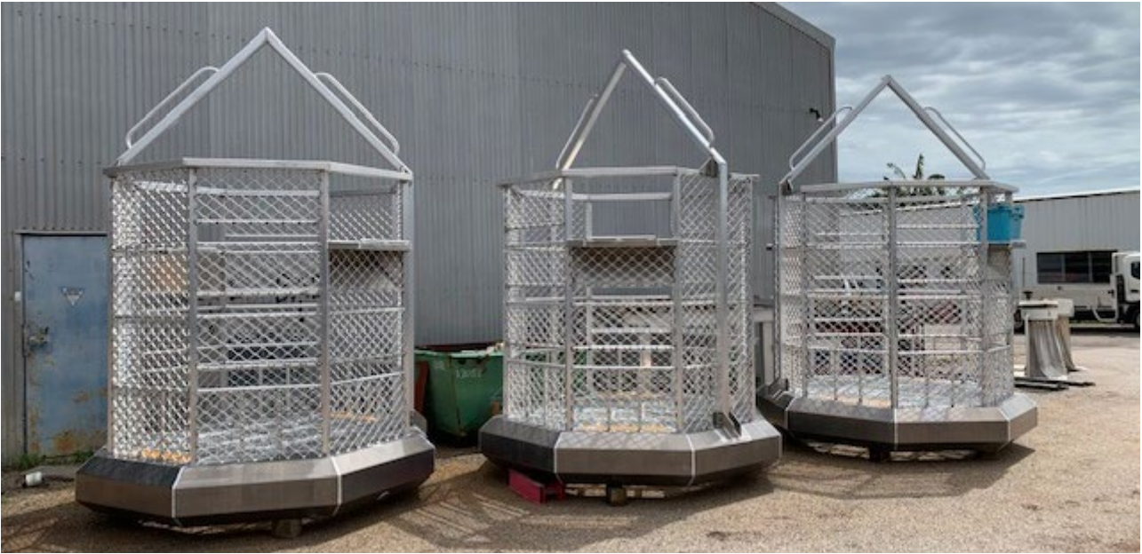
Crocodile Cages– Used for crocodile egg collecting in remote NT