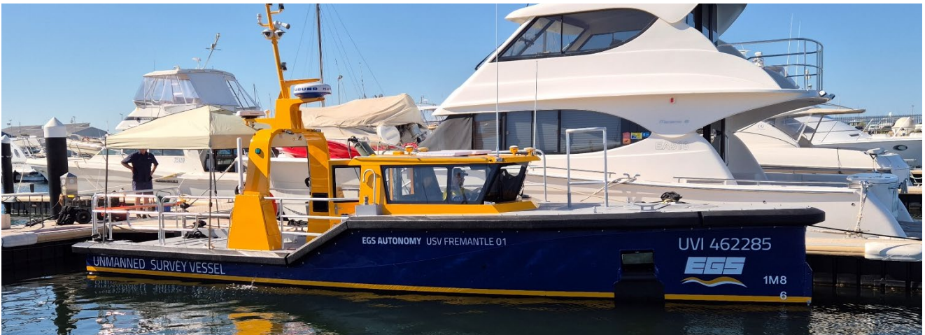
USV Fremantle 1 – 12m unmanned survey vessel, built in Perth, operating from Perth.